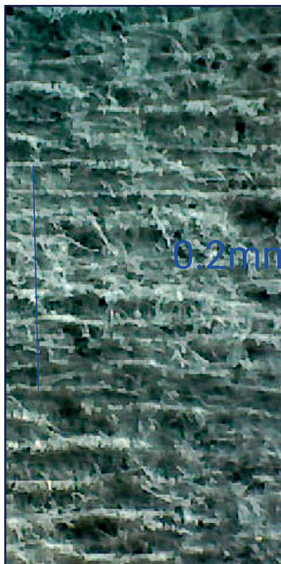
Img.2. Paper from first reel after blade change using Biolube 885A plus Biofilm 446.